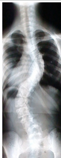
Idiopathic Scoliosis Pre-Operative X-rays 55° Thoracic Curve