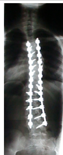
Post-Operative X-rays 19° Thoracic Curve